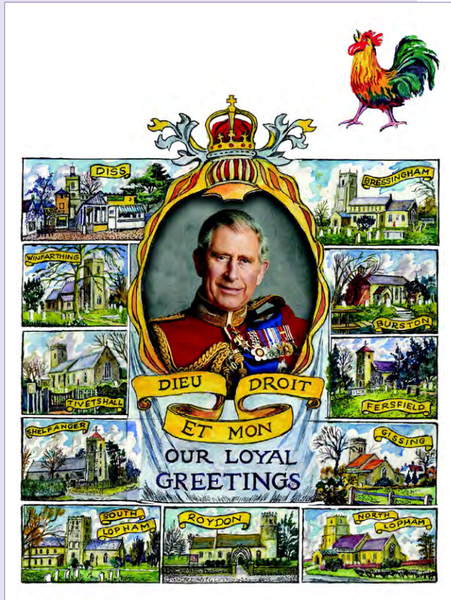
The Coronation Cover of our magazine included pictures of all eleven Churches.