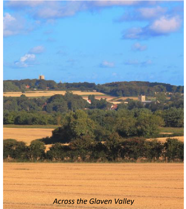
Across the Glaven Valley

To build on the strong foundations of faith, worship and outreach across the Benefice and to continue moving forward in our Church and community life.