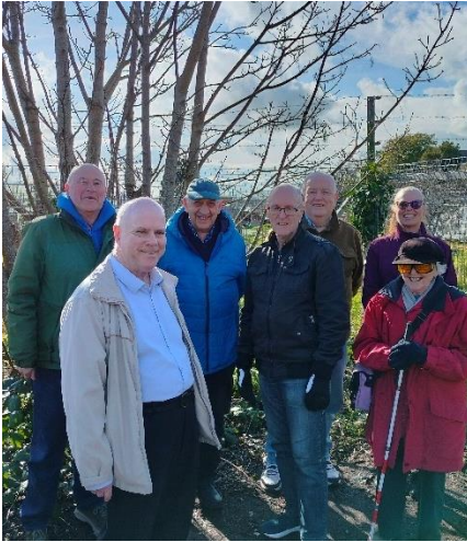
left: A spring prayer walk from St Paul's

The main service is the 9.30am Sunday Eucharist (average 15-20) with a midweek Eucharist every other Wednesday (average 10-12). In 2023 new screens and sound system were introduced which the congregation have appreciated and offer more flexibility in worship.