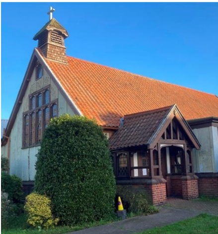
St. Paul's Church, Newtown

Expenses should be submitted on a monthly basis to the Team Treasurer for approval and will be met in full by the PCC from ministry endowment funds.