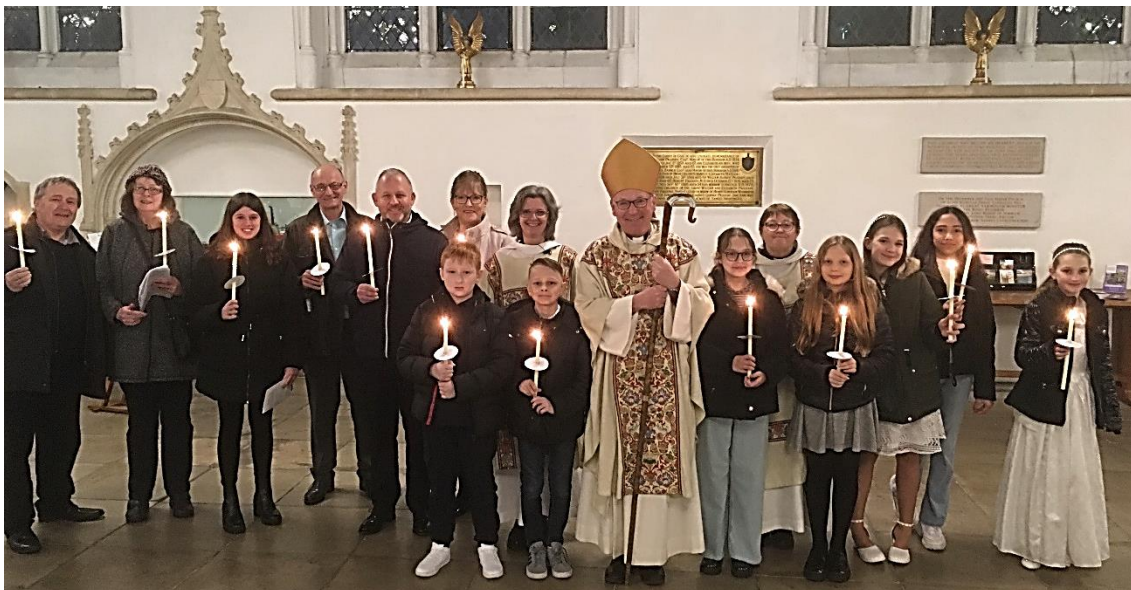
Confirmation in the Minster, Easter 2024

Members of the Ministry Team work together day by day and share in the leading of worship in all three churches. Team Vicars will have clear areas of ministry in the life of the parish which they will be responsible for. They will be expected to show leadership, imagination and vision in their delegated tasks while sharing in the collegial life of the Ministry Team and the PCC with complementary skills. This way of working will need commitment and empathy as it develops so that both the congregation can embrace change and so that the team can develop and flourish.