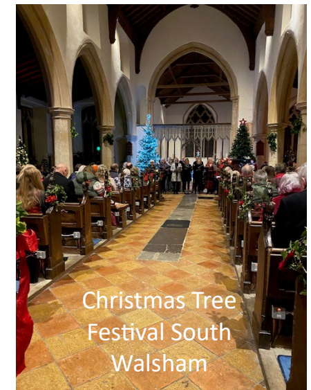
Christmas Tree Festival South Walsham