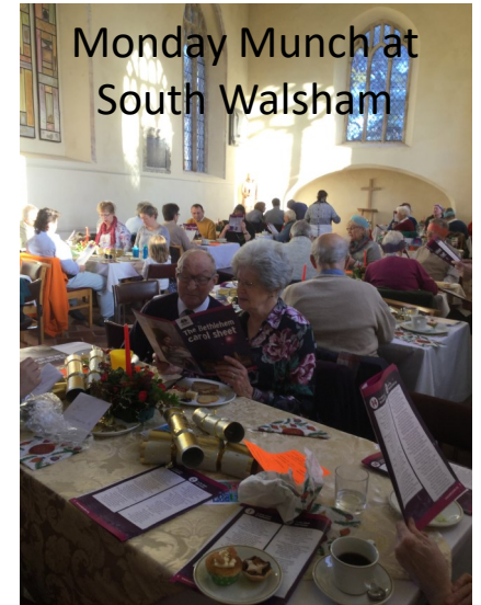
Monday Munch at South Walsham

And we want to do all this with a sense of fun and joy!