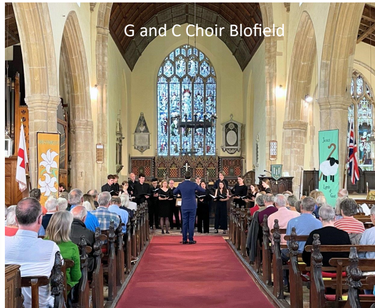
G and C Choir Blofield