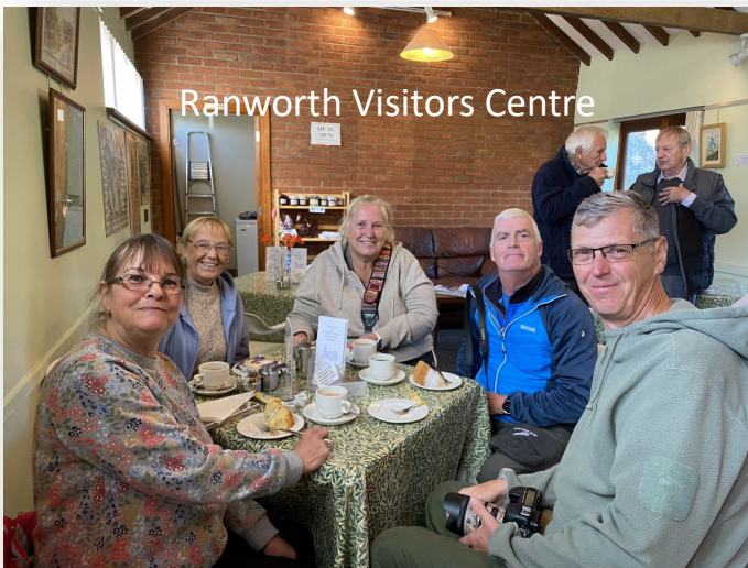
Ranworth Visitors Centre