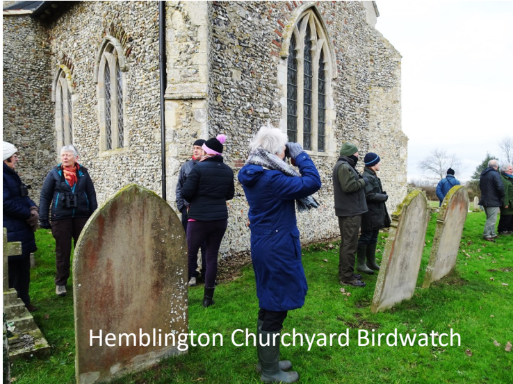
Hemblington Churchyard Birdwatch

Day to day care of our older church and community residents is offered by many across the Blofield and Hemblington churches. This frequently concerns everyday needs, for example car transport, shopping and just sitting with the lonely and housebound. We are also attentive to the spiritual needs of the older folks in the church and community, especially the bereaved. To this end we have an Anna Chaplain who is available for visiting and taking communion to those church members who are unable to attend church.