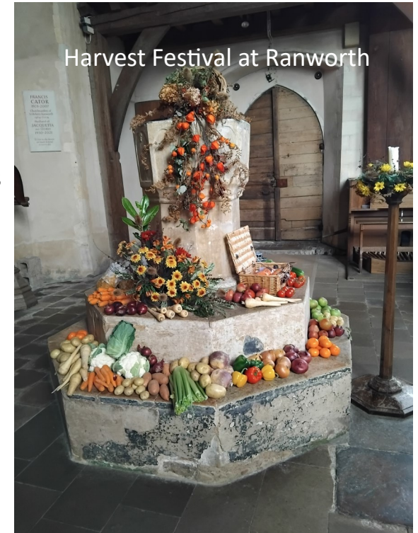
Harvest Festival at Ranworth

In South Walsham and Upton members of the congregation have specific people 'to keep an eye on' those who need support in some form or other. In Upton there are regular visits to the Broadland Park residential home (suspended during Interregnum.)