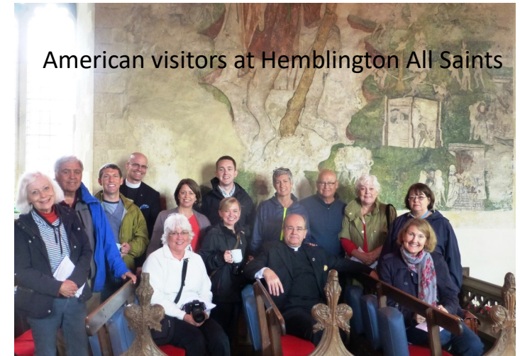
American visitors at Hemblington All Saints

Rotas are prepared monthly or quarterly for Readers, Intercessors, Sides people, Welcomers, Holy Communion assistants, coffee duty, locking and unlocking churches, flowers and cleaning.