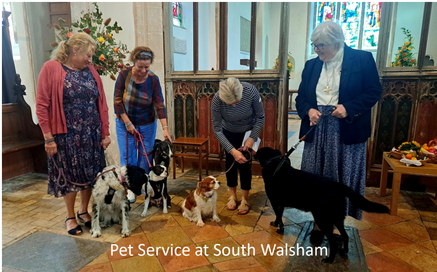
Pet Service at South Walsham

Day to day care of our older church and community residents is offered by many across the Blofield and Hemblington churches. This frequently concerns everyday needs, for example car transport, shopping and just sitting with the lonely and housebound. We are also attentive to the spiritual needs of the older folks in the church and community, especially the bereaved. To this end we have an Anna Chaplain who is available for visiting and taking communion to those church members who are unable to attend church.