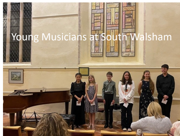
Young Musicians at South Walsham

Our PCCs and church teams keep our churches maintained, cleaned, relevant and functioning. They have a wealth of experience and local knowledge. They are the foundation on which we build and grow.