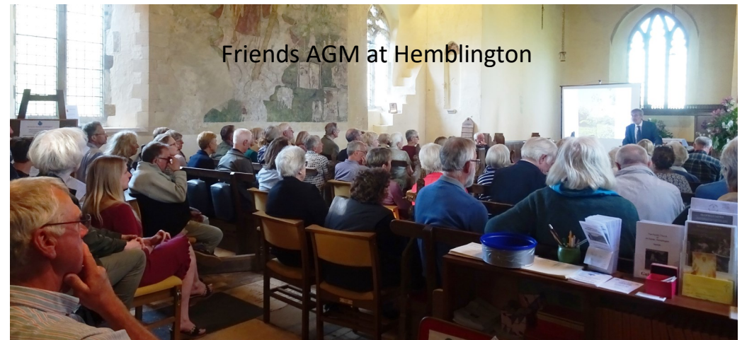
Friends AGM at Hemblington