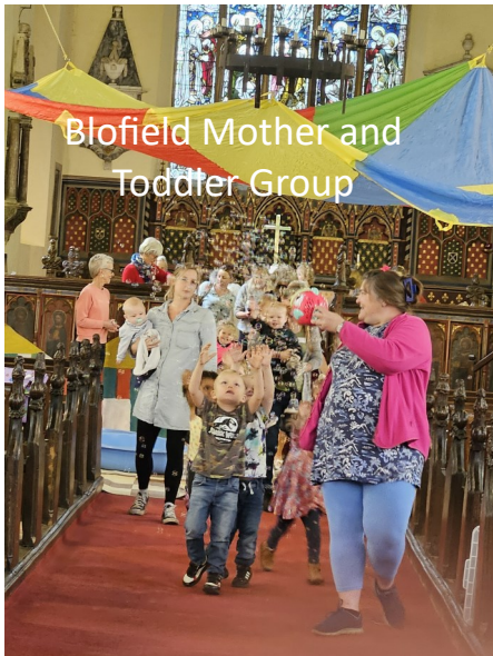
Blofield Mother and Toddler Group

To be God's light in the community, welcoming, working together and caring for everyone we meet by making the Gospel of Christ known and relevant to all in their everyday lives.