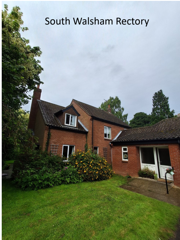
South Walsham Rectory

South Walsham Rectory: The Rectory was built in 1983 specifically for the use of an Incumbent. As a result, there is a large study and toilet separate from the family accommodation. There are five bedrooms in total – four upstairs and one on the ground floor where there's a lounge, a dining room, a conservatory, kitchen and utility room. The house is adjacent to the church, standing back from the road with secluded gardens, garage and a tank for central heating oil.