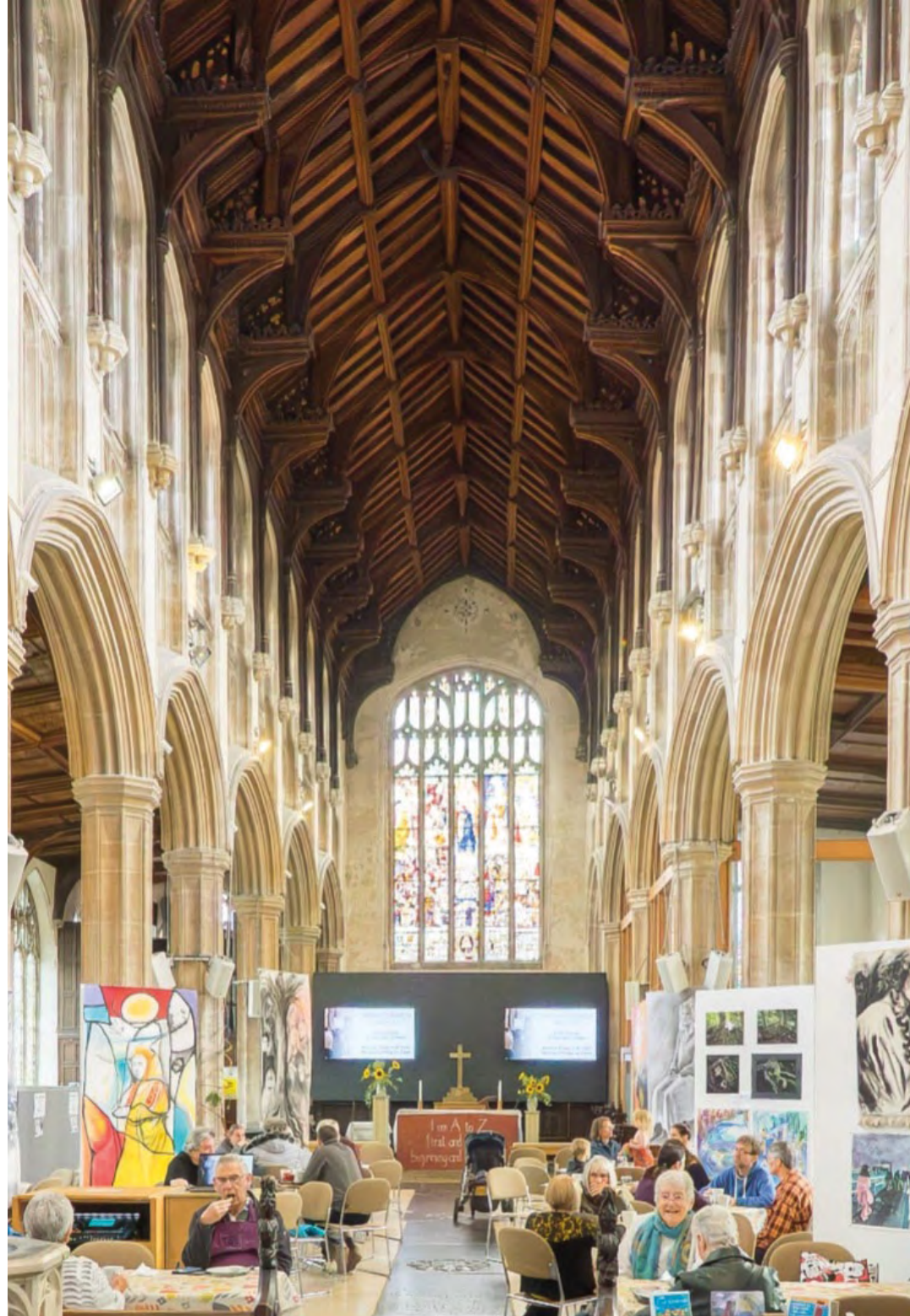
Photo (right): The Café during the Art Exhibition held regularly in September each year. © David White 2024

Additionally on Wednesdays as part of the Renew Wellbeing movement we offer a safe space, a listening ear and activities where 'it's okay to not be okay'.